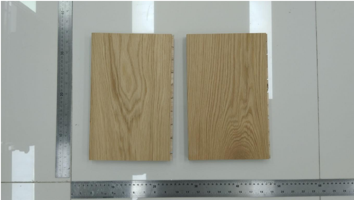
Photo 1. Tested sample – ENGINEERED HARDWOOD FLOORING (item no.: EO1SNBUVL1)